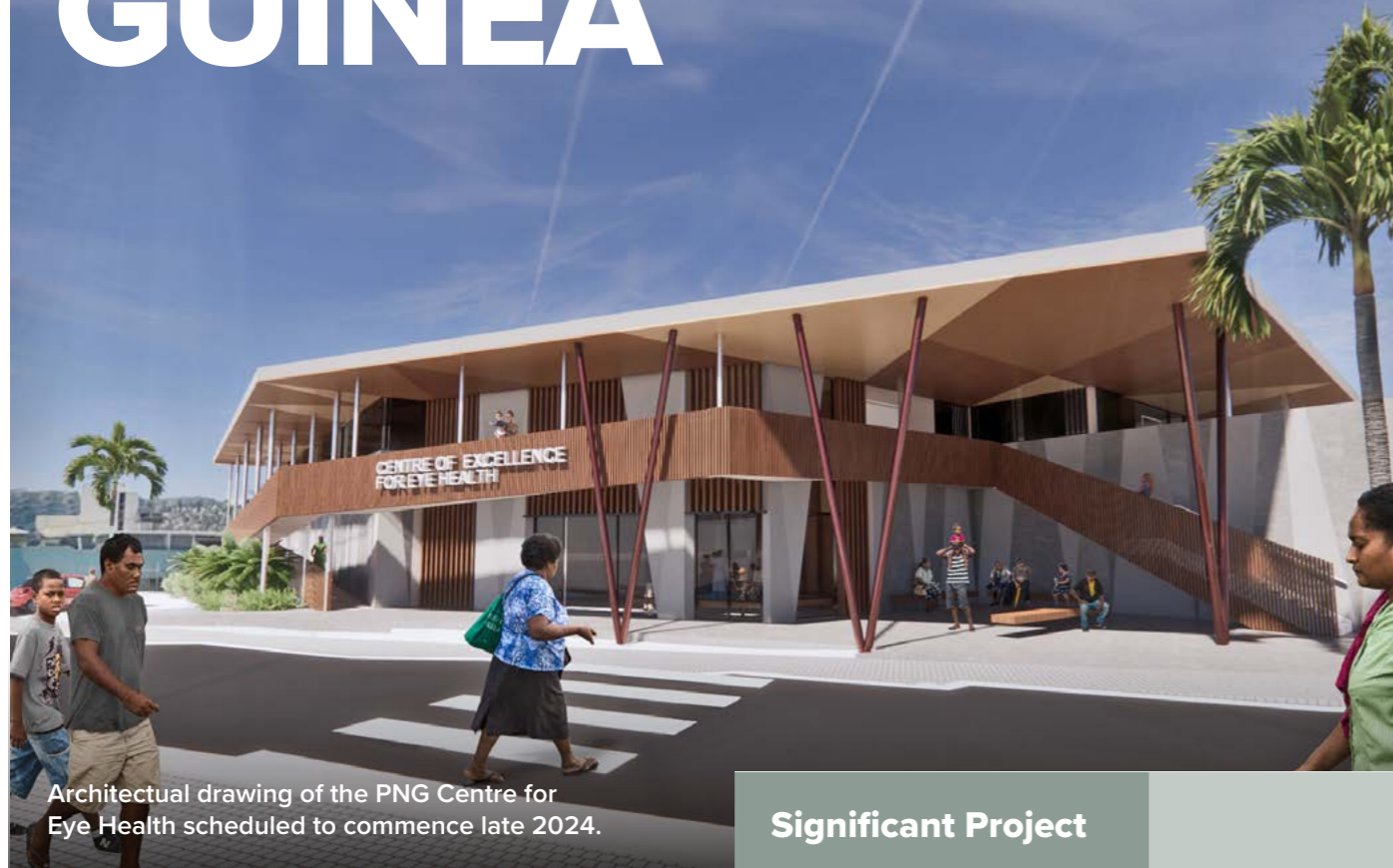
Architectural drawing of the PNG Centre for Eye Health scheduled to commence late 2024.