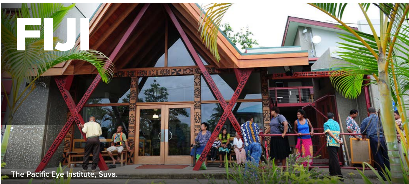
The Pacific Eye Institute, Suva.

The Foundation assists the Ministry of Health and Medical Services of Fiji, through the Pacific Eye Institute based in Suva, to deliver comprehensive eye care services to tens of thousands of Fijians each year.